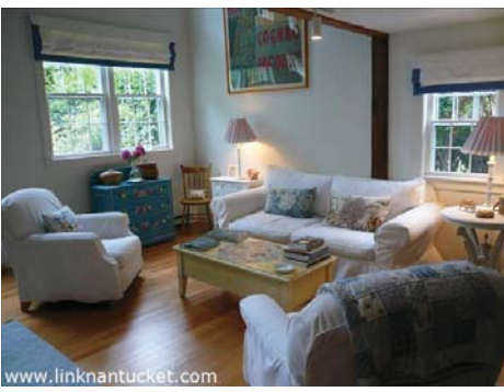
Living room - different view