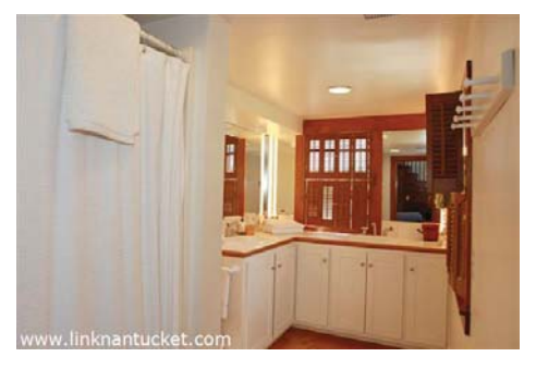
Bath - First Floor