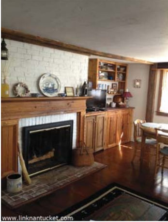
Fireplace in Sitting Room and Dining Room