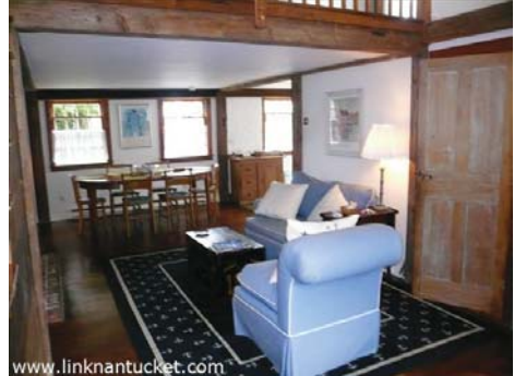
Parlor and Dining