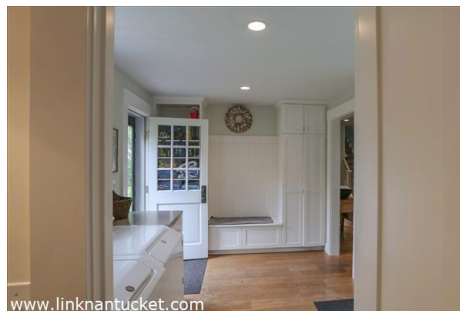
Laundry/mud room leads to first floor full bath