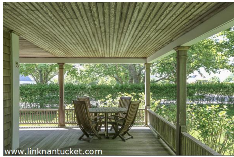
Veranda facing Main Street