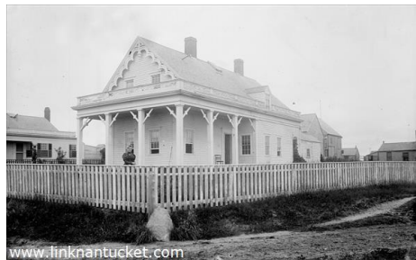
Edgemoor Circa 1890