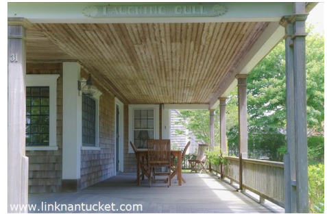
2014 Laughing Gull - 31 Main Street