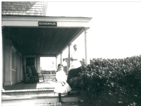
1900-1910 "Edgemoor"