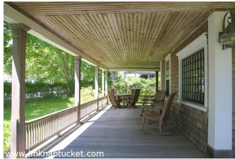
Large covered veranda