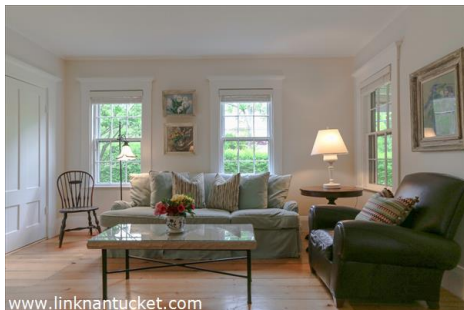
Study or dining room